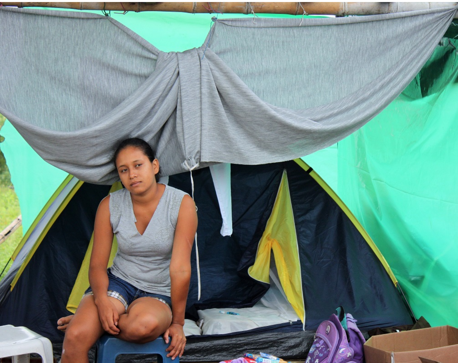
People displaced by the earthquake in Ecuador in 2016 have sought shelter in displacement.

To be effective, DRR and humanitarian assistance efforts need to address the risk and impacts of disaster displacement. In doing so, they should recognise that people already displaced by previous disasters or conflict, including refugees, and the communities that host them tend to have less capacity than their counterparts in the general population to cope with a disaster's impacts and manage future disaster risk.