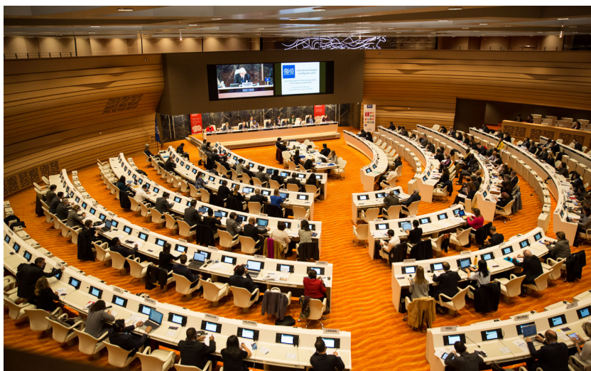
IDM meeting in Geneva.

The 2016 International Dialogue on Migration (IDM), IOM's premier policy forum, consisted of two workshops. Both were dedicated to in-depth discussion of the implementation, follow-up and review of migration in the 2030 Agenda for Sustainable Development, specifically of the migration-related targets under the 17 sustainable development goals (SDGs). The first workshop was held at the United Nations (UN) in New York on 29 February and 1 March (the first regular two-day IDM session to take place there 1 ), and the second in Geneva on 11 and 12 October. The two-part arrangement reflected the importance of bringing together multi-stakeholder policy deliberation on development, which is centred in New York, and on migration, which normally takes