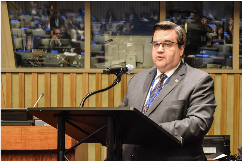
Mr Denis Coderre, Mayor of Montréal at IDM in New York.

Cities are where migration is taking place, with local authorities at the front line of managing the daily lives of the people living on their territories. The authorities are aware of the local population's realities and needs, including those of international migrants and the vulnerable groups among them. Effective migration management therefore requires that local authorities are involved in migration policymaking and national development planning.