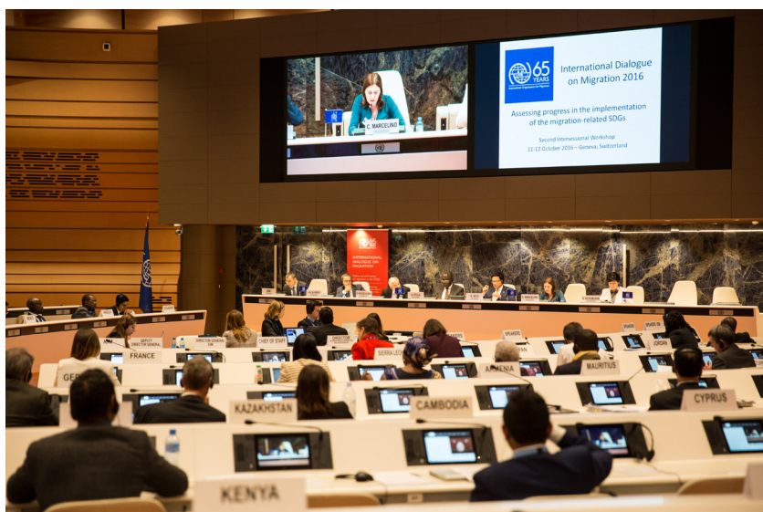
Panel discussion at IDM in Geneva.