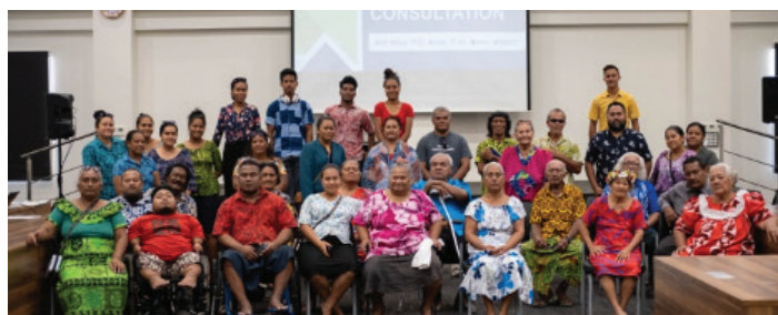
Funafuti Community Consultation at the Tomasi Puapua Convention Centre (TPCC)