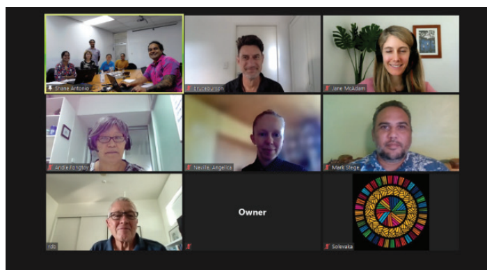
Technical Advisory Group meeting in March 2021