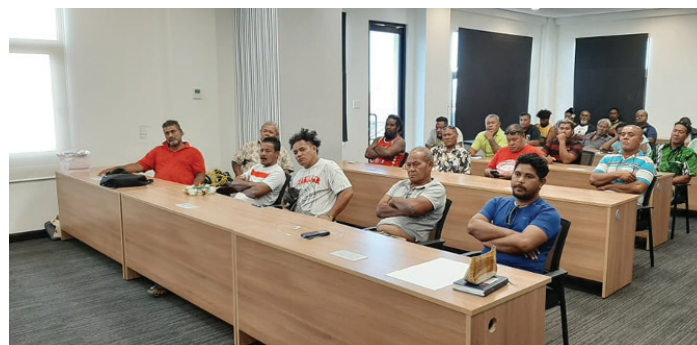
Tuvalu Seafarer refresher course training in session.