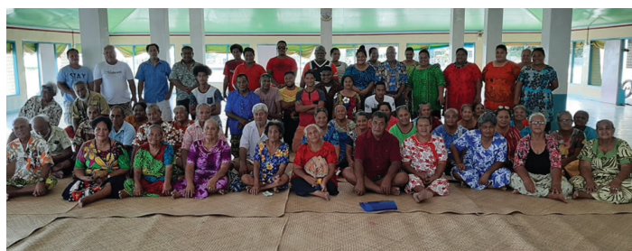
Vaitupu Community Consultation at the Anipule II Community Hall