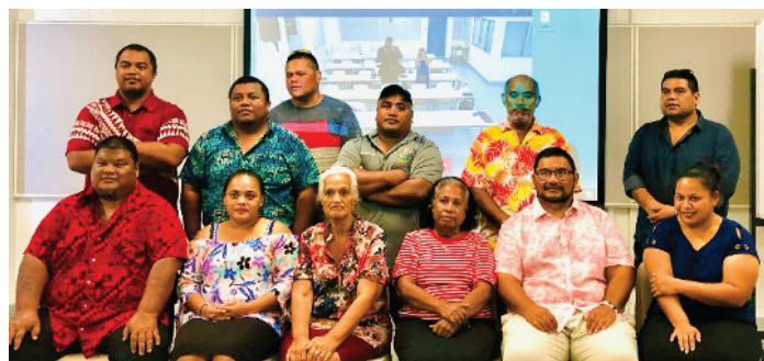
Day one of National Consultations in Nauru with community leaders, civil society organisations and respective stakeholders.