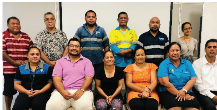
Day two of National Consultations on Climate Mobility in Nauru with government officials.