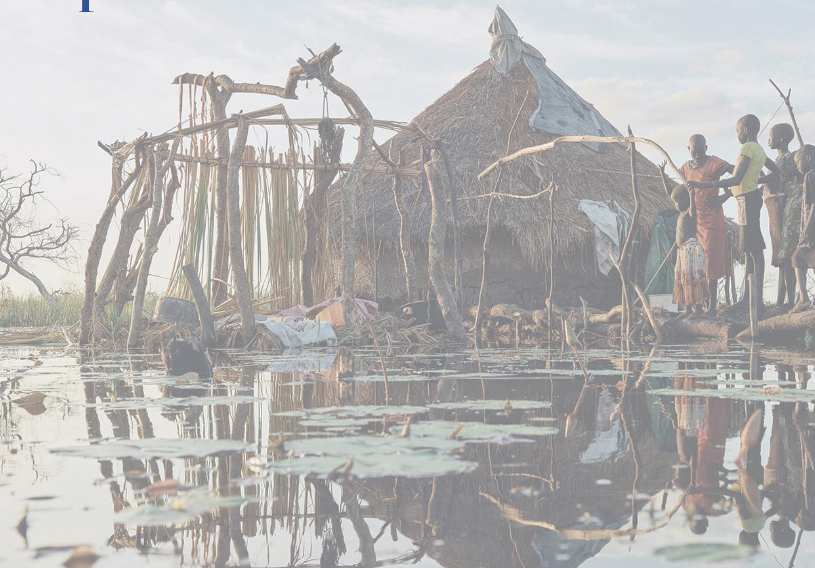
A family looks at their flooded home in South Sudan. Floods left two-thirds of the country under water and affected displaced communities living in camps.

The disaster displacement indicators report was made available for public review to ensure no important aspect was overlooked in expert consultations to date. Comments were collected through 11 November 2022 and received comments will be thoroughly reviewed towards potential revision of the indicators.