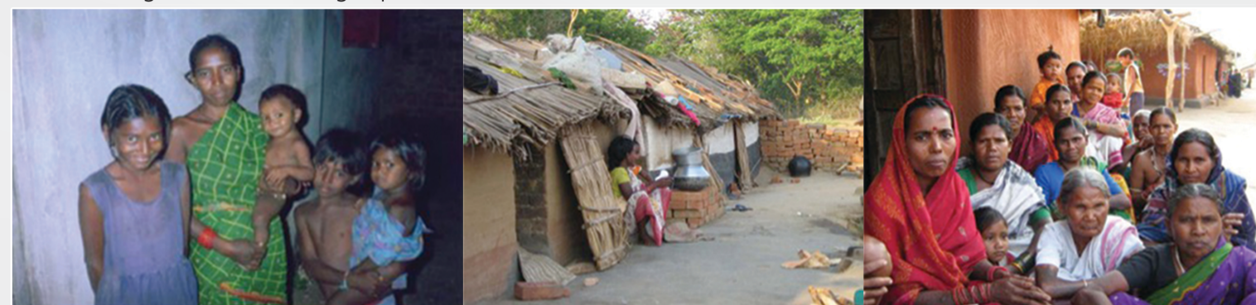
**Source - Impact of Increasing migration on women in Odisha - A study in Nuapadas & Bolangir District, 2007, Sansristi.

This work was carried out under the Collaborative Adaptation Research Initiative in Africa and Asia (CARIAA), with financial support from the UK Government's Department for International Development (DFID) and the International Development Research Centre (IDRC), Canada. The views expressed in this work are those of the creators and do not necessarily represent those of DFID and IDRC or its Board of Governors.