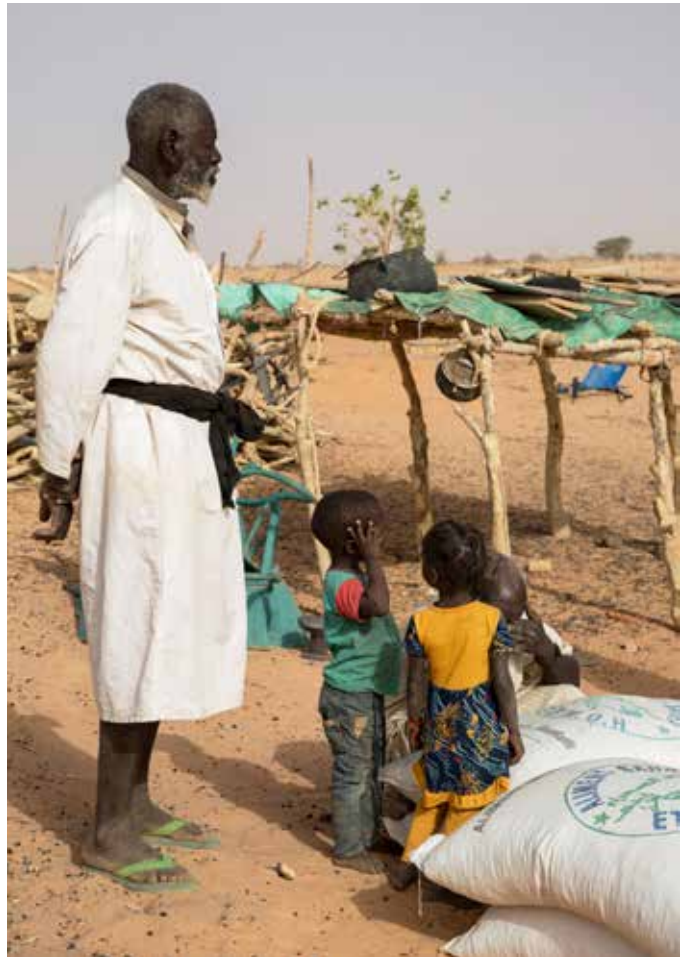
Due to a major drought in 2017 in Mauritania, people in the Hodh El Chargui region are receiving humanitarian assistance, including livestock feed supplies.

However, it is also important to acknowledge that migration can be part of a positive, life-saving strategy when planned and well-managed. For instance, it allows people to cope with the impacts of environmental degradation, open new avenues for livelihood diversification and can encourage the contributions of migrants and diasporas to climate change action in their places of origin.