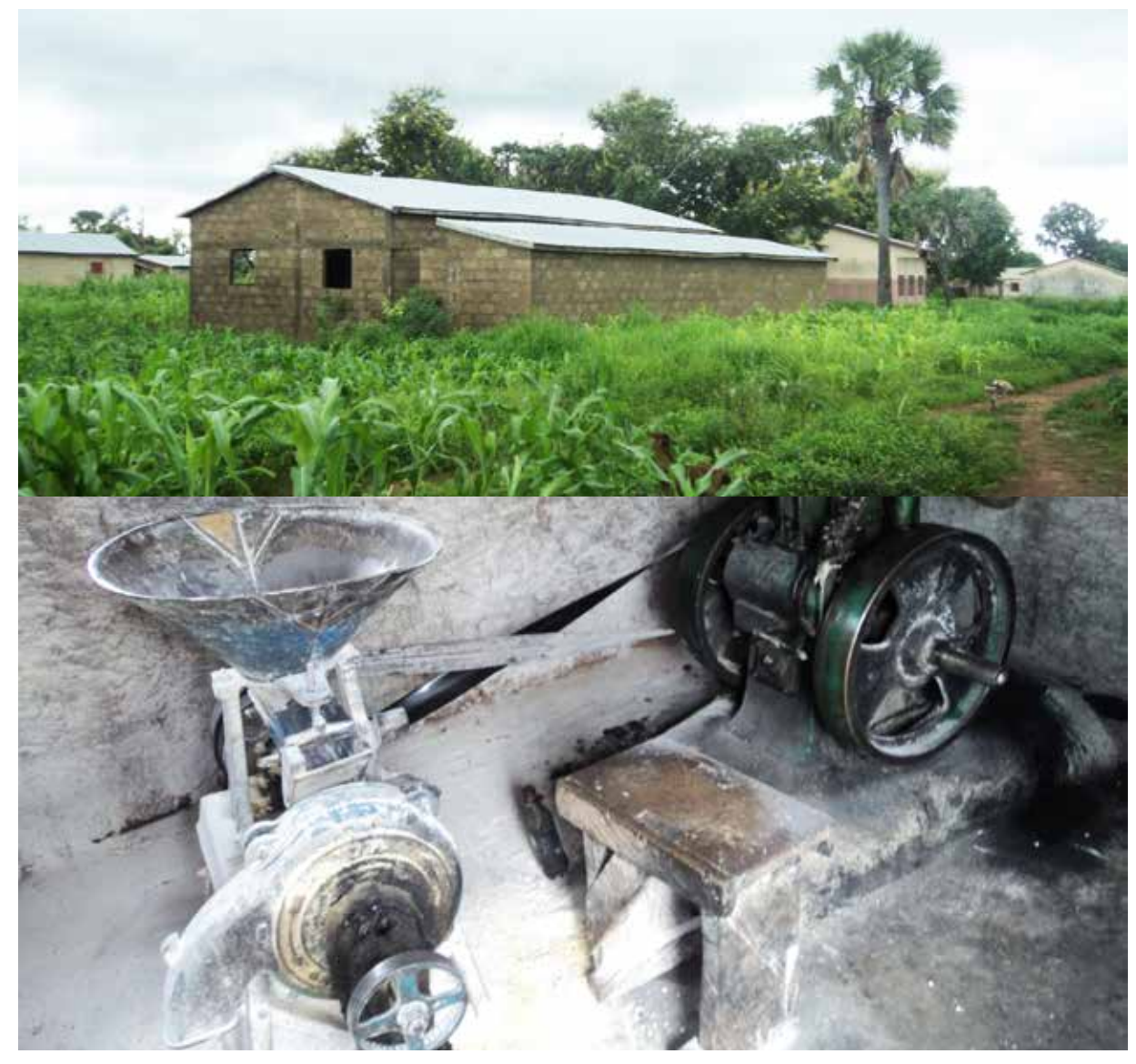
Construction of building and grinding mill with cash remittances (Dassari; Porga)